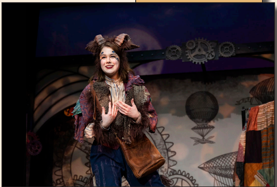
Puck in the 2021 touring production of A Midsummer Night's Dream.

The story of Pyramus and Thisbe is found in Ovid's Metamorphoses , and its plot is strikingly similar to that of another Shakespeare play written around the same time as Midsummer — Romeo & Juliet .