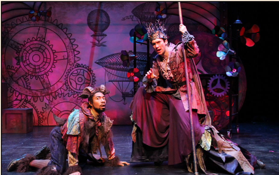
Oberon conspires with Puck in the 2019 touring production of A Midsummer Night's Dream .

For centuries, fairies were a source of fear and anxiety for many communities. These beings were believed to be forces of nature, fiendish creatures that were sometimes seen as little different than the demons of hell. Fairies were blamed for all kinds of mishaps, from a freak storm that destroyed the crops to a “spooked” horse that threw its rider. At best, their behavior towards humans was prankish, at its worst,