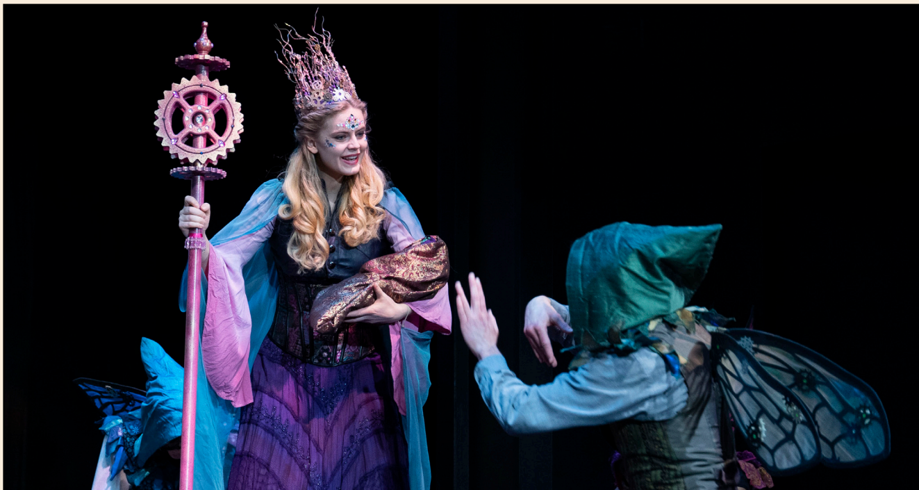
Titania and the Fairies in the 2021 touring production of A Midsummer Night's Dream.