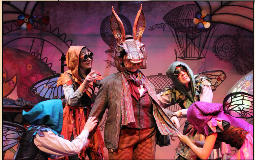
Bottom and the Fairies from the 2019 touring production of A Midsummer Night's Dream . Photo by Joe Guerin

The names of the Mechanicals mostly reflect their occupations. Bottom, the weaver, is named for a skein of yarn or thread, called a "bottom." The name of Quince, the carpenter, suggests "quines," or blocks of wood used by carpenters in building. Flute is a bellows mender-- the bellows has a fluted shape, and was used to compress air to stoke a fire or to produce sound (as in a church organ). Snout, the tinker, would have been a mender of pots, pans and kettles-- the spout of a kettle was often called a "snout" in Shakespeare's time. Snug is a joiner, one who manufactures cabinets and other jointed furniture made of snug-fitting pieces of wood. Finally, in Shakespeare's time, tailors were usually depicted as abjectly poor and thus, rail-thin from hunger— in other words, "starvelings."