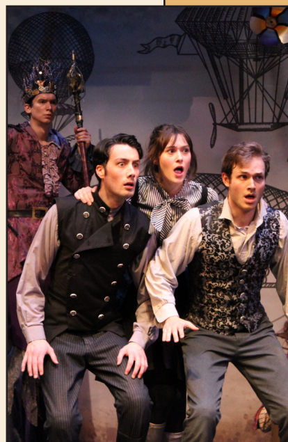
Demetrius and Lysander protect Helena in the 2019 touring production of A Midsummer Night's Dream.

Isaac Asimov notes that "there is a folk belief that extreme heat is a cause of madness (hence the phrase 'midsummer madness') and this is not entirely a fable. The higher the sun and the longer it beats down, the more likely one is to get sunstroke, and mild attacks of sunstroke could be conducive to all sorts of hallucinatory experiences. Midsummer, then, is the time when people are most apt to imagine fantastic experiences."