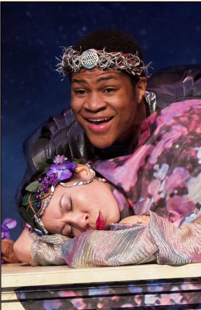
Oberon and Titania in the 2015 touring production of A Midsummer Night's Dream .