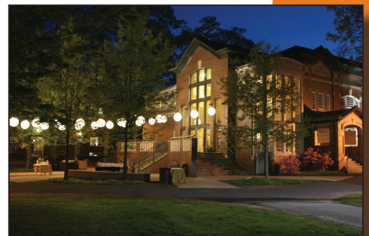
The Shakespeare Theatre of New Jersey's Main Stage